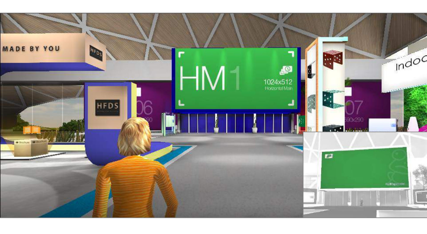
Central Rotating Banner

2 large horizontal billboards (clickable)